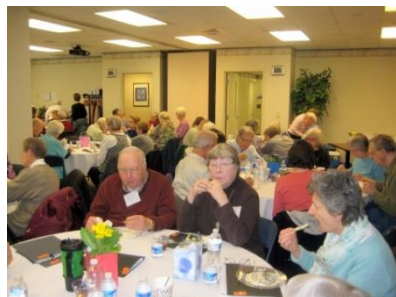
Attendees at the 2014 Seminar

attended the all-day event -- "Managing Parkinson's Disease: An Educational Program for the Community." Attendees came from the entire 4-state area around Hagerstown, including the Parkinson's Support