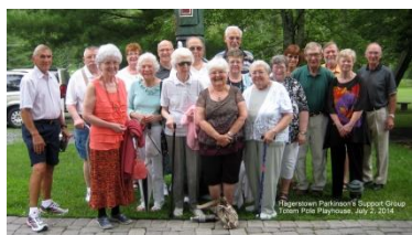
Totem Pole Playhouse Group