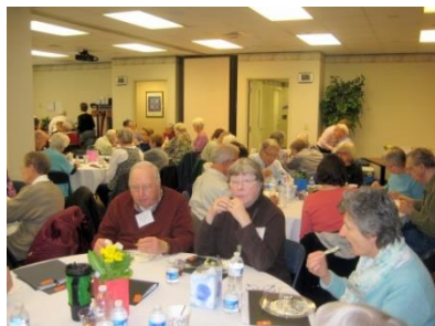
Attendees at the 2014 Seminar