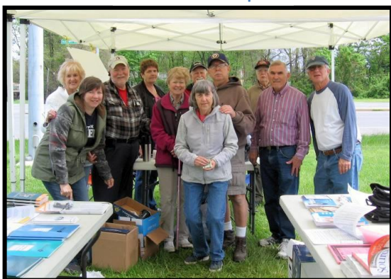
The Yard Sale Group

It was a fun day and a very successful one. The group collected nearly $2000 in sales and donations. More than a dozen members came out to help with the money-making event.